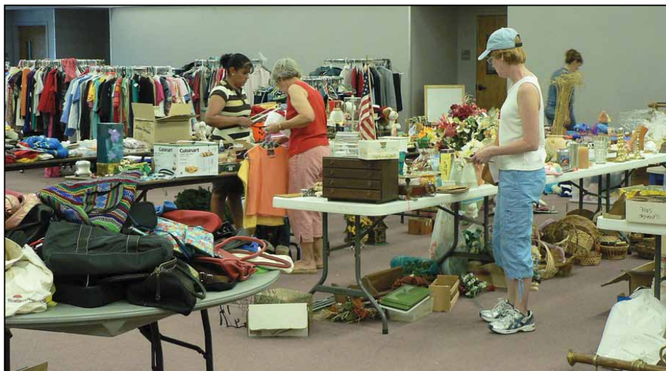
"Missions" accomplished. Shoppers browse at the 2009 Missions Garage Sale on Sat., June 27. Over $2400 was raised - a new record for this event. Thanks to all who helped.