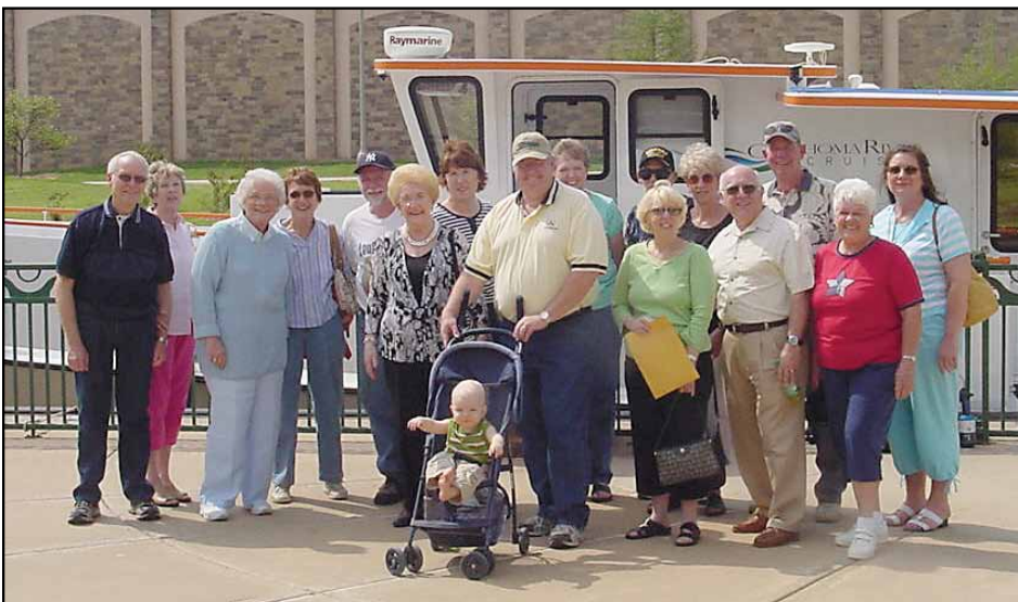
Ahoy! Back in April, Fellowship Group #3 enjoyed the three hour boat ride on the Oklahoma River Cruise. They had a blast and highly recommend the cruise.

Church of the Good Shepherd has four active United Methodist Women Circles. If you would like to learn more about the UMW pick up a brochure in the Information Center. ■