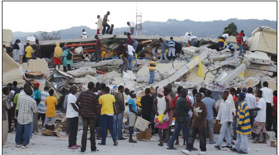
Residents search for survivors among the debris after a 7.0 magnitude earthquake in Port-au-Prince Jan. 13. The Haitian president said he feared tens of thousands were dead after the presidential palace, schools, hospitals and hillside shanties collapsed, leaving the Caribbean nation appealing for international help.